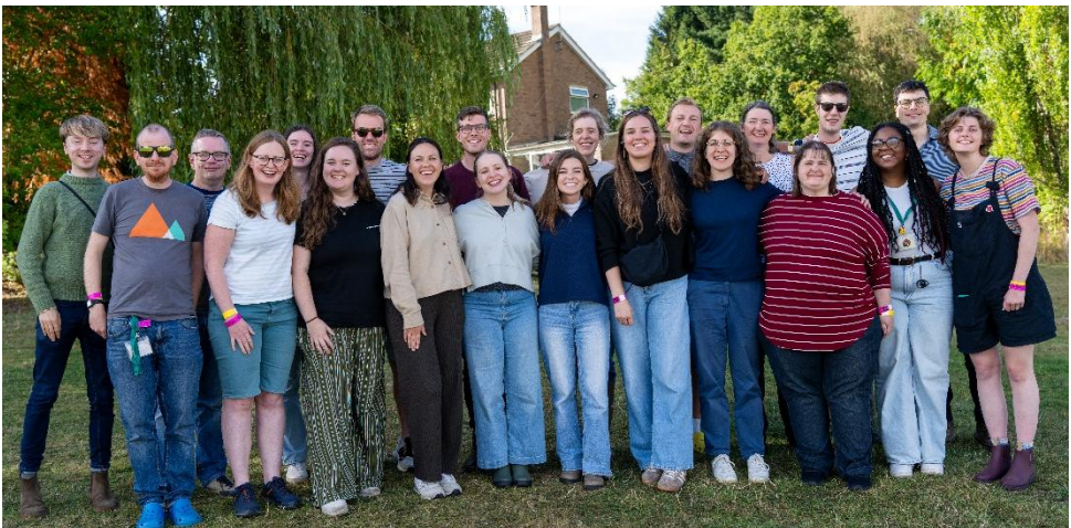
Our Operations Team at Forum 2025

Nature and Scope: As this role is involved in equipping and resourcing students, CU leaders, and UCCF supporters, it is an occupational requirement that the post holder is in sympathy with the Doctrinal Basis but will not be formally required to sign assent to the Doctrinal Basis. They will be expected to attend UCCF collective worship and prayer and to model Christian discipleship in public and private life.