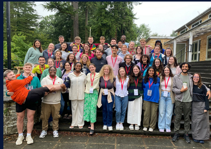
Relay Cohort 24-25